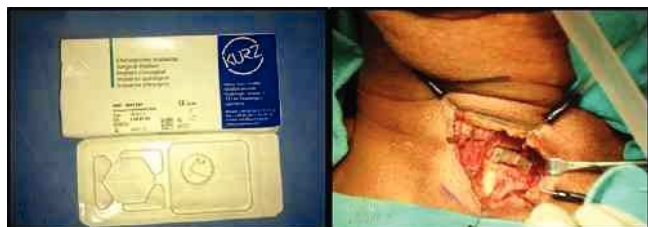
Figure 2 A, Titanium vocal fold medializing implant (TVFMI®). B, TVFMI® placed in the cartilage window.

post-operative values of GRBAS were compared separately using paired Student's t-test. Individual parameters of acoustic analysis and EGG were also compared pre- and post-operatively, and the p-values were calculated. Student's t-test for independent variables was used to compare the improvement in parameters (VHI, GRBAS, acoustic analysis, EGG) following the type I thyroplasty with silastic implant or TVFMI®. p-values less than 0.05 were considered to be significant (95% confidence interval).