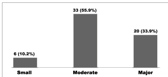
Graph 1. Impact on the quality of life in children seen between August of 2008 and March of 2009; n (%).

suffering" ( 17.3 \pm 5.0 ), "emotional suffering" ( 11.8 \pm 4.52 ), and "diurnal problems" ( 8.0 \pm 4.0 ). The mean global score for quality of life was 5.35 \pm 1.45 .