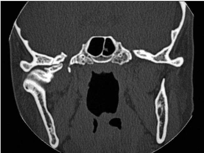
Figure 5. Coronal CT scan: peripheral osteoma in the right-side mandible condyle.

are large enough to cause facial asymmetry or some functional deficit.