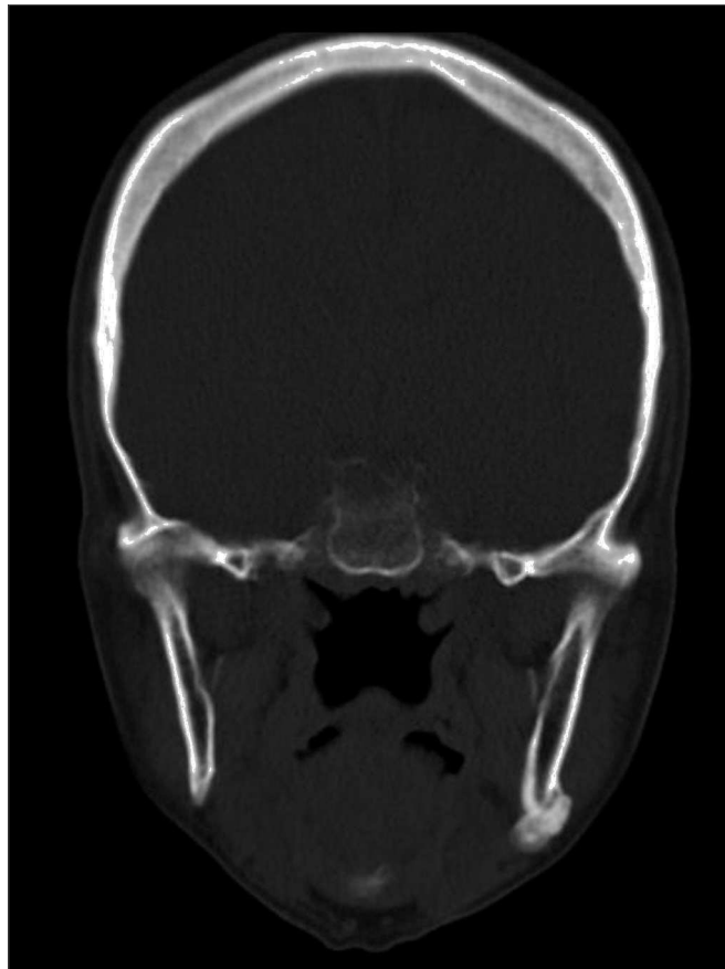
Figure 3. 2-year postoperative: Coronal view showing a recurrence in the left mandible angle.

The three cases located in the condyle caused facial asymmetry, dental malocclusion and consequent functional deficit (Figures 4 and 5).