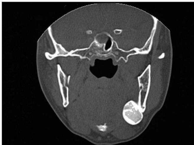
Figure 1. Preoperative aspect: Coronal CT scan showing a peripheral osteoma in the left mandible angle.

There was one recurrence two years after the surgery (Figures 1, 2 and 3). A new surgery was done, and we did not have signs of recurrence after three and a half years of follow up.