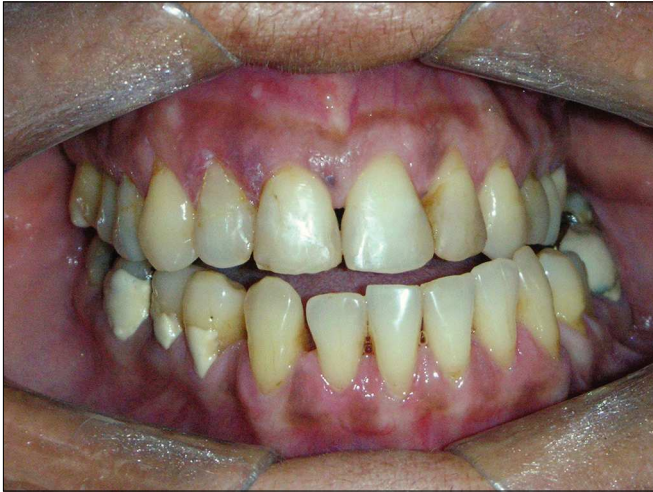
Figure 4. Occlusal changes: deviation from the midline and cross-bite caused by osteoma in the right mandible condyle.