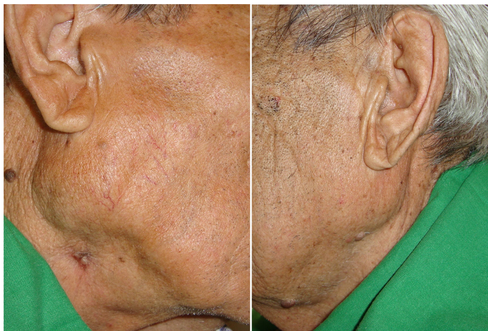
Figure 3 Pictures obtained after treatment was completed (10 month). The parotid gland swelling reduced on both sides and the ulcerative lesion on the right side healed.

technique to differentiate both types of pathologies. Histological and microbiological tests must be run on the tissue sample. Histology testing often shows granulomatous inflammation, while the microbiological diagnosis could be achieved by acid-fast bacilli staining, mycobacterial culture or PCR-based assays. Unfortunately, cultures result negative in 40.9% 3 of cases, due to the control of bacillary replication by an immunocompetent host against an attenuated mycobacteria strain. A CT scan may be a helpful tool in achieving the complete diagnosis as it helps determine the extension of the disease and it is used in the follow-up to evaluate the response to the treatment. 2