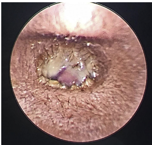
Figure 1 Polypoidal mass occluding left ear canal.

there was loss of left nasolabial fold and drooping of left angle of lip. Otoloscopic examination revealed a polypoidal mass occluding the entire left ear canal covered with bloody, foul smelling otorrhea (Fig. 1). Right ear canal examination was normal with an intact tympanic membrane. Oropharynx examination was unremarkable and neck nodes were not palpable. Nasoendoscopy revealed mild adenoid enlargement with no signs of active infection. All other cranial nerves were intact and no other neurological deficit was evident. Systemic examination was normal. Tuning fork test revealed left conductive hearing loss. Full blood count and electrolytes were within normal range. Preliminary diagnosis of left aural polyp with facial nerve palsy grade III was made with a differential diagnosis of external canal cholesteatoma. Patient was started with intravenous ciprofloxacin with tapering dose of prednisolone. Subsequent day, facial nerve palsy was noted to improve demonstrating facial nerve palsy House-Brackmann grade II.