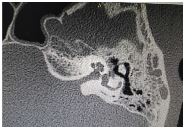
Figure 2 Inflammation over tympanic segment of facial nerve.

Patient underwent microscope-guided examination under anaesthesia which revealed polypoidal mass occupying entire lateral third of ear canal with whitish keratin-like debris noted medial to the mass. Polypectomy and aural toileting was commenced. As tympanic membrane appeared bulging, myringotomy and grommet insertion was performed. Histopathologic examination revealed cyst wall covered with stratified squamous epithelium containing lamellated keratin flakes suggestive of keratosi obturans (Fig. 3) Post-operatively patient was well. He was discharged home following day as the facial asymmetry improved with only slight weakness noted upon close inspection with