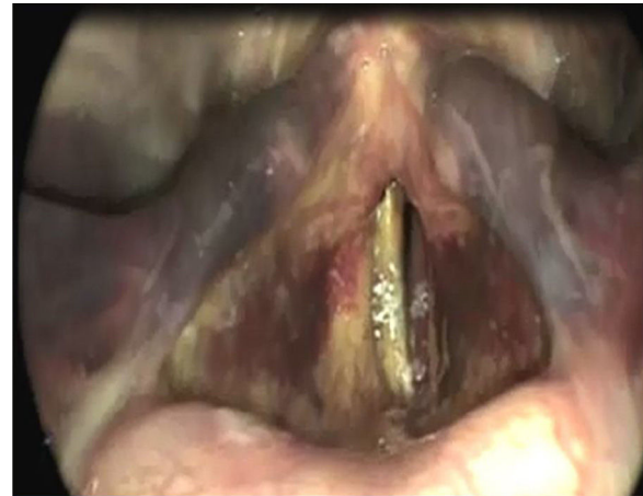
Figure 4 Laryngeal hematoma.

The Table 3 shows the correlation between histopathology and type of surgery. Total thyroidectomy with and without