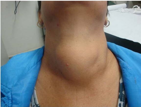
Figure 2 Large goiter in patients with hoarseness and respiratory distress.