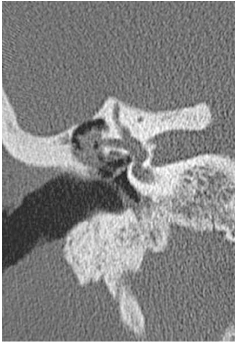
Figure 1 LF (lateral semicircular canal) in a CT scan.

years (SD = 18.70). The characteristics of the total sample are shown in Table 2 .